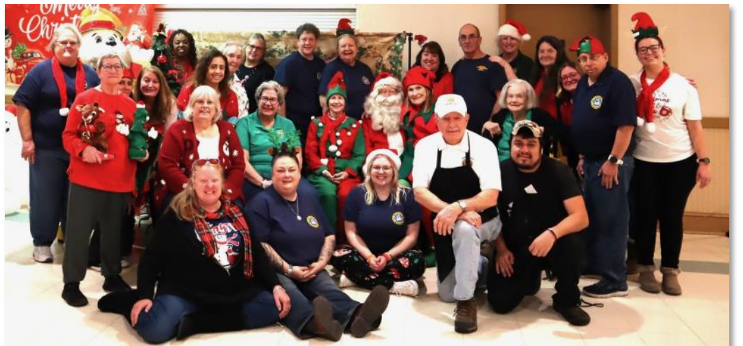
THANK YOU TO ALL OF OUR BREAKFAST WITH SANTA VOLUNTEERS!